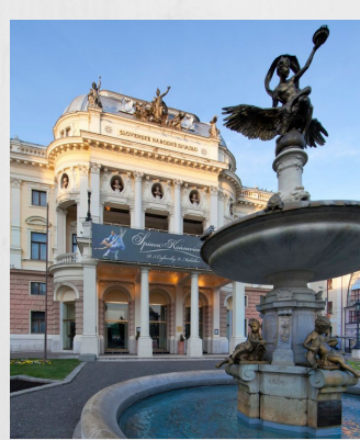
SLOVAK NATIONAL THEATRE