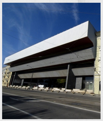
SLOVAK NATIONAL GALLERY