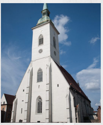
ST MARTIN'S CATHEDRAL