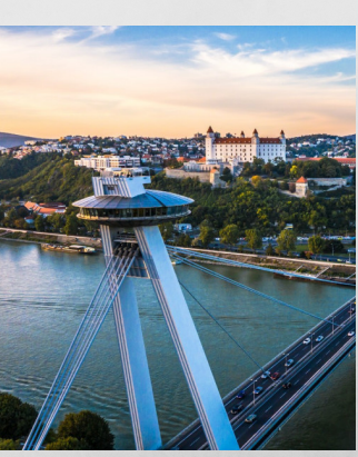
UFO AT THE SNP BRIDGE