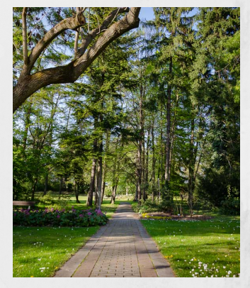
ACADEMY AND BOTANICAL GARDEN